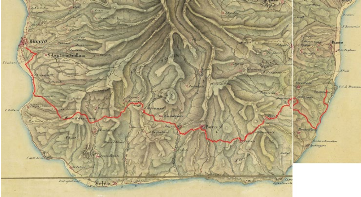
Figure 1. Edward Lear's walking path traced on the Austrian Map of the Kingdom of Naples, 1847; https://anticabibliotecacoriglianorossano.it/mappe-e-carte-geografiche/carta-austriaca-del-regno-delle-due-sicilie (accessed 2 December 2024) (elaboration by R.M. Rombolà).

Lear's descriptions and sketches, combined with the information provided by the Austrian map of the Kingdom of Naples in 1847, enable us to study and understand the mid-19 th century landscape of the region. In various instances, the traveller emphasizes the isolation of the different villages, the orography of the territory, the difficulties of travel, the relationship with riverbeds as critical elements for crops and villages, and the backwardness and poverty characterizing the encountered villages (figs. 2-5).