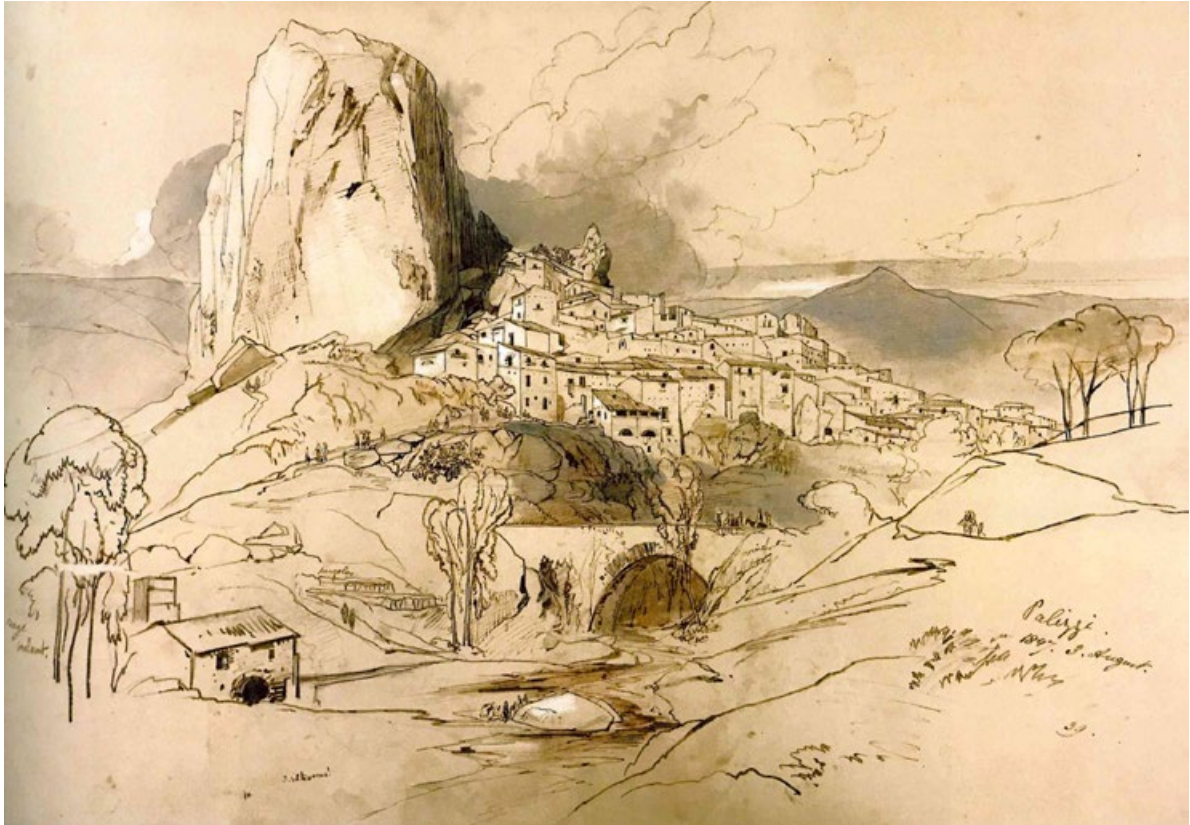
Figure 4. Edward Lear's travel sketches, Palizzi (GAETANO 2023).