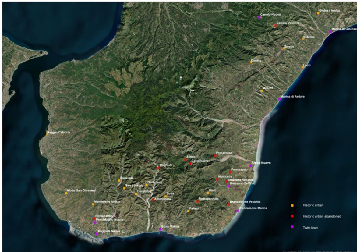
Figure 7. Map of abandonment and new locations (elaboration by R.M. Rombolà).