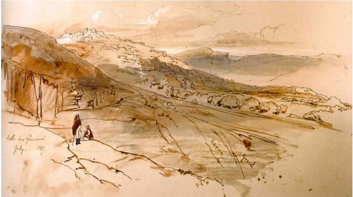
Figure 2. Edward Lear's travel sketches, Motta San Giovanni (GAETANO 2023).