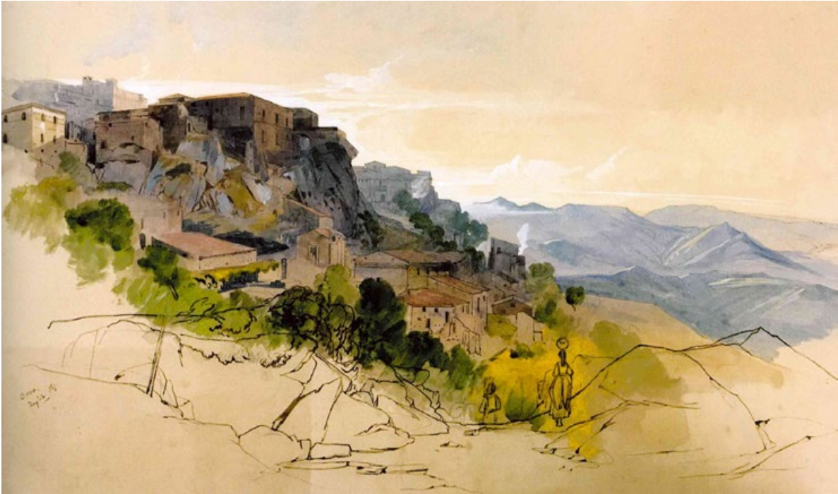
Figure 3. Edward Lear's travel sketches, Bova (GAETANO 2023).