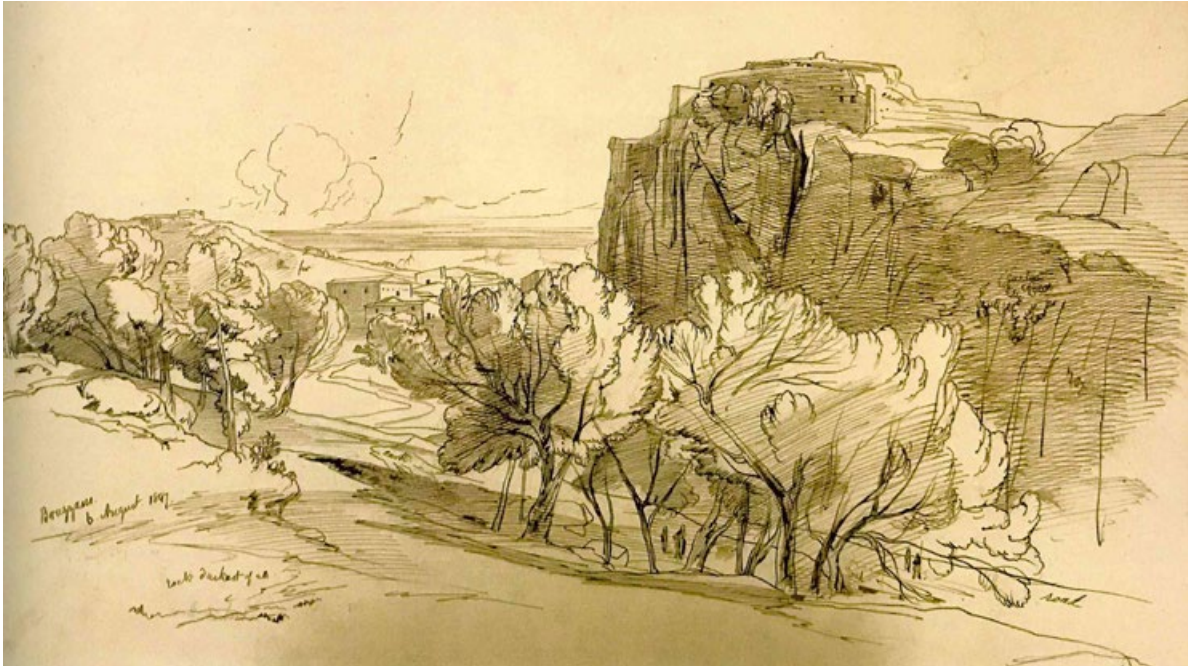
Figure 5. Edward Lear's travel sketches, Bruzzano Zeffirio (GAETANO 2023).